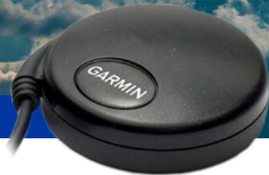
GPS unit detail